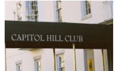
Site of the USACA Fall Meeting: The Capitol Hill Club

TITLE: Cost reduction for manufacturing ceramic matrix composites (CMC). ( Cont. p.2 )