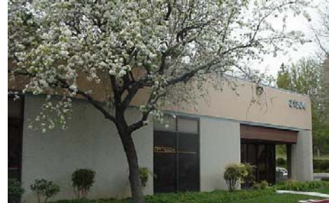
Matech office in Westlake Village, CA.